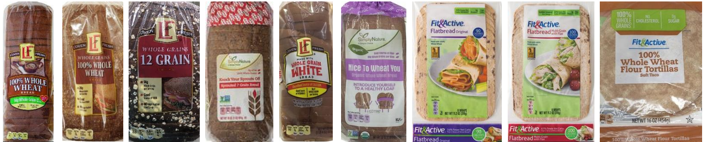
L'Oven Fresh 100% Whole Wheat Bread L'Oven Fresh 100% Whole Wheat Bread Wide Pan L'Oven Fresh 12 Grain Bread Simply Nature Knock Your Sprouts Off Bread L'Oven Fresh Made with Whole Grain White Bread Simply Nature Nice to Wheat You Bread Fit & Active Flatbread Original Fit & Active Flatbread Multi-Grain with Flax Fit & Active 100% Whole Wheat Flour Tortillas