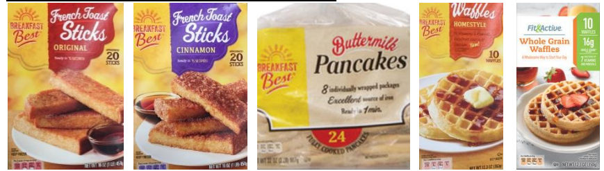
Breakfast Best French Toast Sticks Original Breakfast Best French Toast Sticks Cinnamon Breakfast Best Buttermilk Pancakes Breakfast Best Waffles Homestyle Fit & Active Whole Grain Waffles