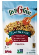
Granola Cranberry Cashew