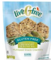
Multiseed Crackers Rosemary & Olive Oil