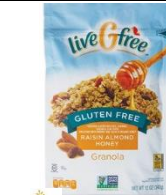
Granola Raisin Almond