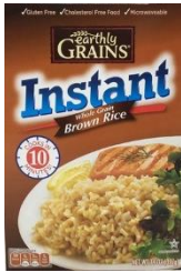
Earthly Grains Instant Brown Rice