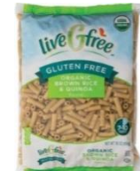
Brown Rice & Quinoa Penne