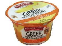
Friendly Farms Greek Fruit on the Bottom All flavors

For questions about if a product is creditable and/or whole grain-rich, please contact Providers Choice.