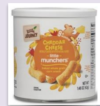
Little Journey Little Munchers Baked Whole Grain Corn Snack Puff Cheddar Cheese Veggie