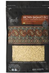
Specially Selected Brown Basmati Rice