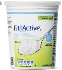
Fit & Active Nonfat Plain or Vanilla