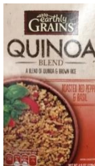
Earthly Grains Quinoa Blend Red Pepper & Basil