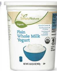
Simply Nature Whole Milk Plain or Vanilla