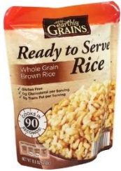
Earthly Grains Ready to Serve Brown Rice