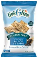
Black Sesame Crisps