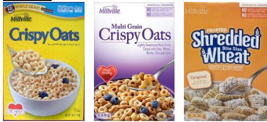
Crispy Oats Original Crispy Oats Multi Grain Frosted Shredded Wheat Bite Size