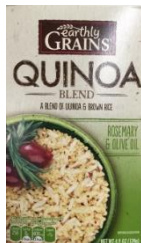
Earthly Grains Quinoa Blend Rosemary & Olive Oil