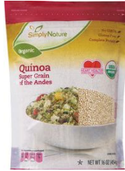
Simply Nature Quinoa