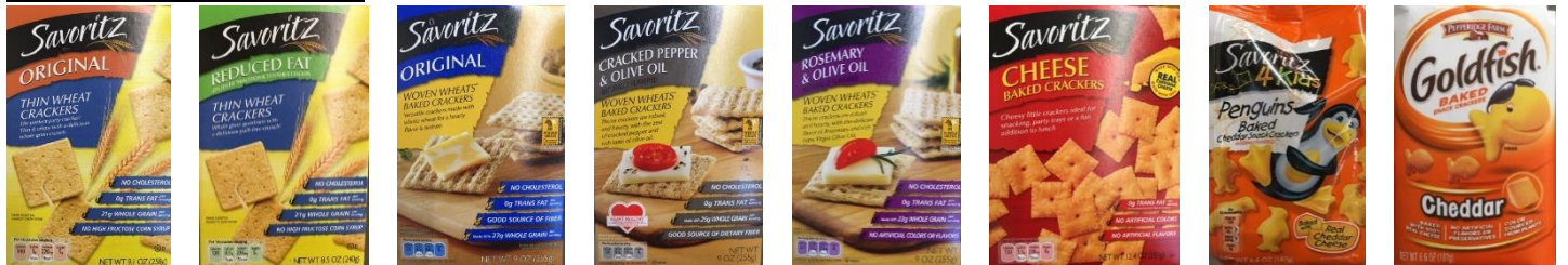
Savoritz Original Thin Wheat Crackers Savoritz Reduced Fat Thin Wheat Crackers Savoritz Original Woven Wheats Crackers Savoritz Cracked Pepper & Olive Oil Woven Wheat Crackers Savoritz Rosemary Woven Wheats Crackers Savoritz Cheese Baked Crackers Savoritz 4 Kids Penguins Cheddar Snack Cracker Goldfish Cheddar Snack Cracker