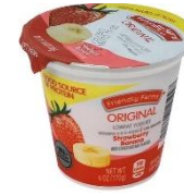
Friendly Farms Original All flavors