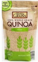
Earthly Grains White Quinoa