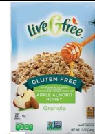
Granola Apple Almond