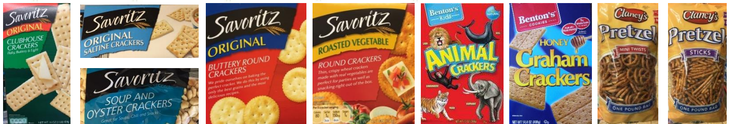
Savoritz Original Clubhouse Crackers Savoritz Original Salty and Oyster Crackers Savoritz Original Buttery Round Crackers Savoritz Roasted Vegetable & Wheat Round Crackers Benton's Animal Crackers Benton's Graham Crackers Honey & Cinnamon Clancy's Pretzels Mini Twists Clancy's Pretzels Sticks