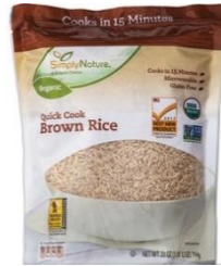
Simply Nature Quick Cook Brown Rice