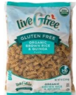
Brown Rice & Quinoa Fusilli