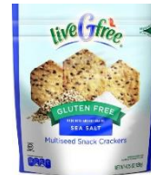
Multiseed Crackers Sea Salt