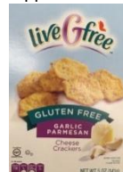
Cheese Crackers Garlic Parmesan