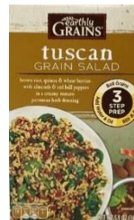
Earthly Grains Tuscan Grain Salad