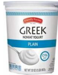
Friendly Farms Greek Plain or Vanilla