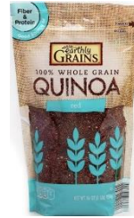
Earthly Grains Red Quinoa