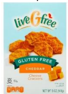
Cheese Crackers Cheddar