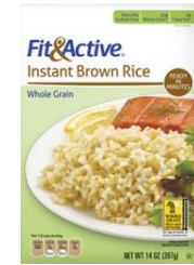
Fit & Active Instant Brown Rice